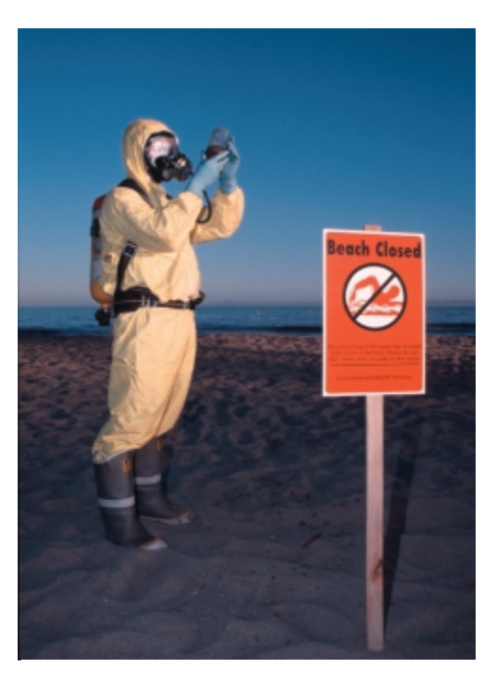
Photo #2: Coastal waters may be highly polluted, especially after heavy rains.