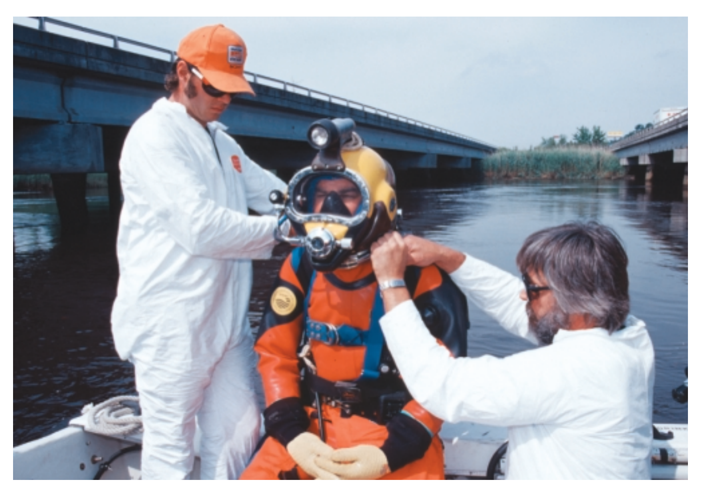
Photo #1: Divers must be properly equipped for diving in polluted water.