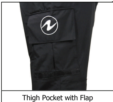
Thigh Pocket with Flap