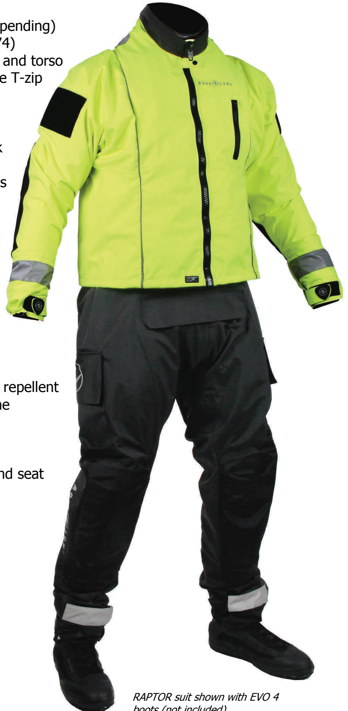
RAPTOR suit shown with EVO 4 boots (not included)

Accessories: Zipper Lube and Instruction Manual