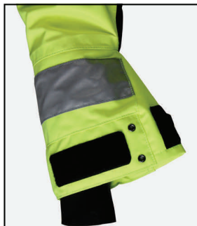
Wrist Seal with Overlay