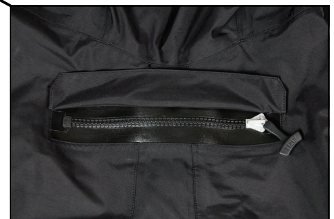
Relief/Comfort Zipper with Flap