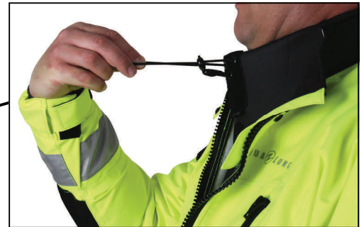
Patented Quick-Adjust Neoprene Neckseal